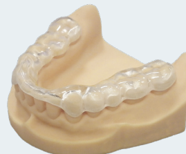
Night guards and bite splints SmileGuard resin E-Guard resin