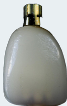
Single-unit implant and full coverage crowns Flexcera Smile Ultra+ resin