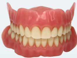
Full and partial denture bases Flexcera Base Ultra+ resins

From dentures to implant cases, smile design and more Find your perfect fit workflow with Desktop Health medical-grade resins