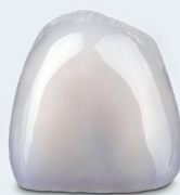
Veneers, inlays and onlays Flexcera Smile Ultra+ resin