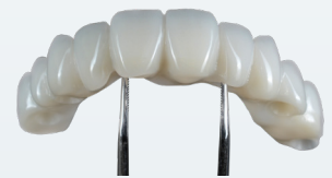
All-on-X implant supported dentures Flexcera Smile Ultra+ resin