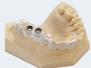
Clear surgical drill guides E-Guide resin