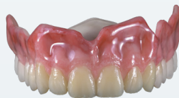
Monolithic, try-in and partial dentures Flexcera Smile Ultra+ resins